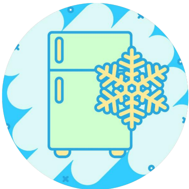
2-8°C Bulk storage

Fast, stable, saving, shorter experiment time, 4°C storage temperature, 25μL loading volume breaking the Mouse limit (the same as some of the indicators in Human & Rat)