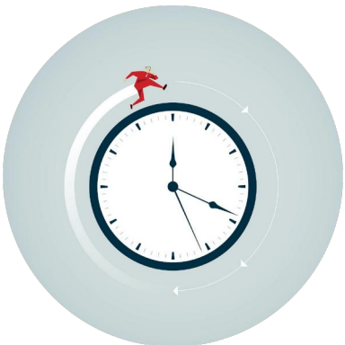
Micro & Fast Roll into one